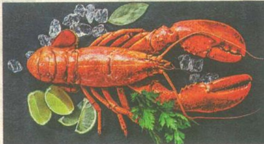
■ Cafe on M offers freshly shucked oysters and the highlighted dish, jet-fresh Boston lobster.

Other highlight seafood choices include steamed fresh crab with glutinous rice in a bamboo basket; marinated salmon with herbs, honey and pear; and braised fresh clams in chicken and ginseng broth.